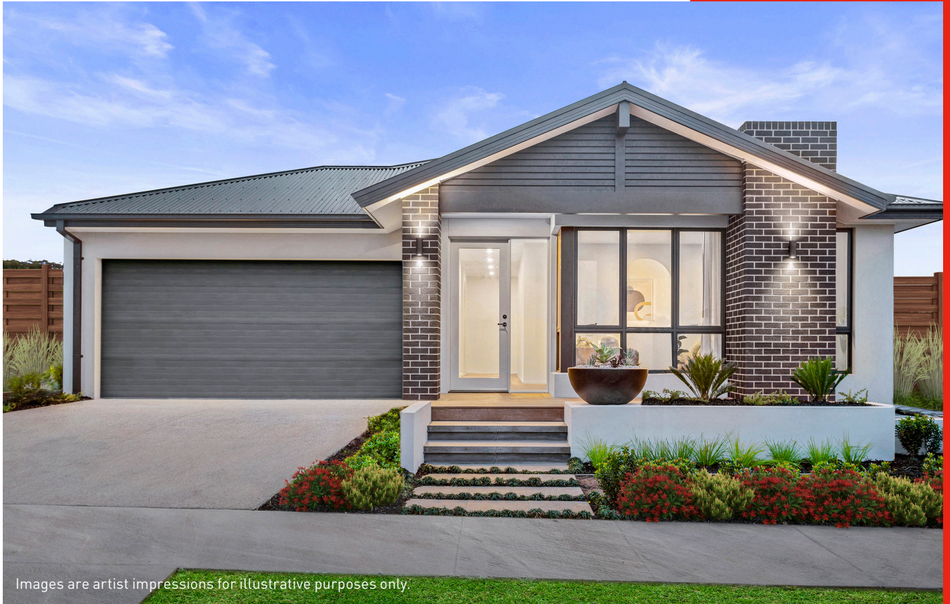
Images are artist impressions for illustrative purposes only.

LAWSON 28 | 236 Sovereign Drive, Mount Duneed | $889,900